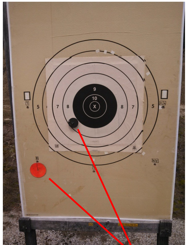
Shot Value is an 8