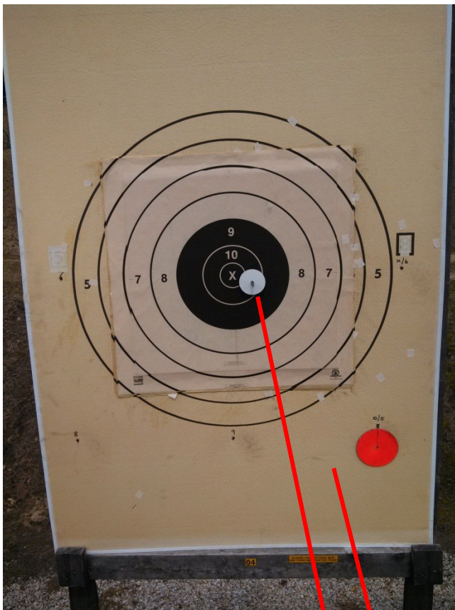
Shot Value is a 10